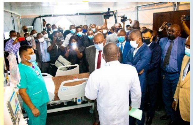
Visit of the clinic fitted out for the campaign