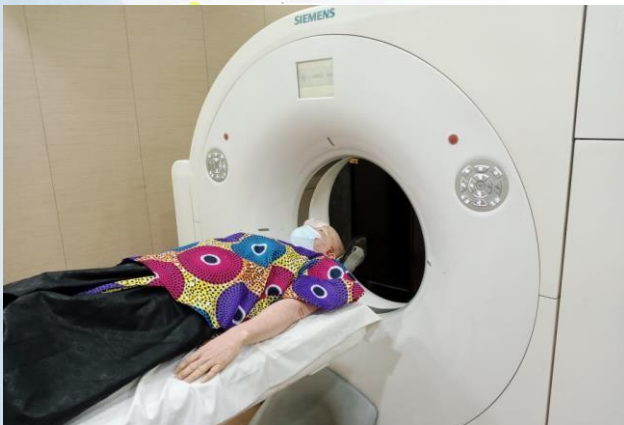
In full examination