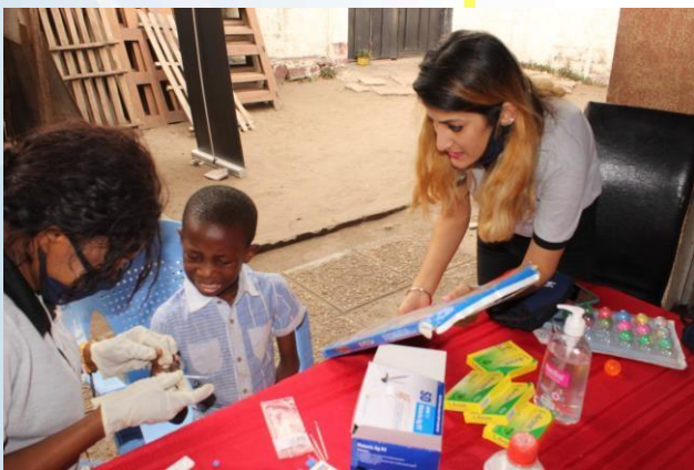
In full screening

In the continuity of the fight against malaria which still kills the whole of the African continent in general and in our country the DRC in particular, it is in this context to fight against malaria that HJ Foundation has carried out a free malaria screening campaign at the Domus Angeli orphanage in the town of Masina where we were able to screen around twenty children with the support of our various partners.