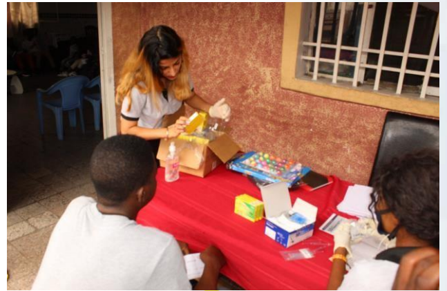
Delivery of medicines